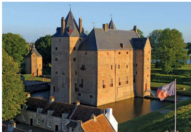
Tauck's exclusive dinner at 14th-century Slot Loevestein in the Netherlands puts an entire island kingdom at your feet.