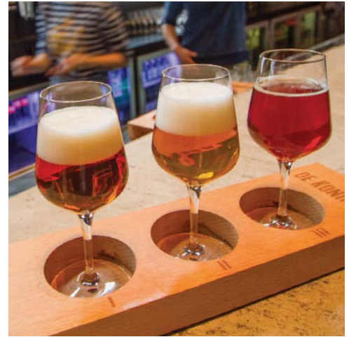
Journey to the summit of Glacier 3000, the only place in the world where you can walk peak-to-peak across a suspension bridge high above the Alps; Belgian ales rule in Antwerp and your beer tasting offers you an opportunity to experience the ones you like best.