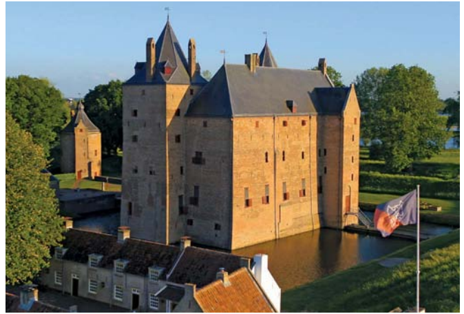
Tauck's exclusive dinner at 14th-century Slot Loevestein in the Netherlands puts an entire island kingdom at your feet.