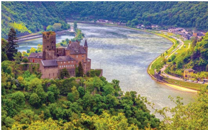
Cruise through the Middle Rhine Valley where 40 majestic castles keep watch over this strategic stretch of the river.

Tour ends: Brussels. Disembark ship by 9:00 AM. Fly home anytime; a transfer from your riverboat to Brussels Airport is included. Allow three hours for flight check-in. Meals B